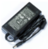
24V 2.5A power adapter